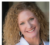
BY DR DUSTY JESSEN 5 Keys Communication

A critical component in modern clinical practice.